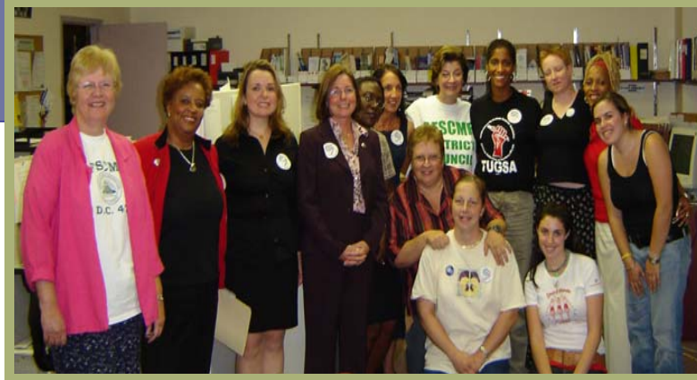
WomenVote PA / Phone Bank Volunteers

Imagining what our foremothers who fought to secure the right of women to vote in the United States 84 years ago would think if they knew the reality of women’s voting patterns in Pennsylvania today, the Women’s Law Project took action. WomenVote PA sprang into action in November 2003, building a coalition of women’s groups across Pennsylvania with the goal of improving the status of women in Pennsylvania by aggressively registering new women voters, increasing the voting participation rate by women, and creating a progressive women’s public policy agenda.