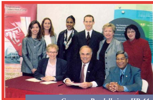
Governor Rendell signs HB 44

Powerful testimony convinced legislators to restore benefits to support recovery from addiction and reunification of families.